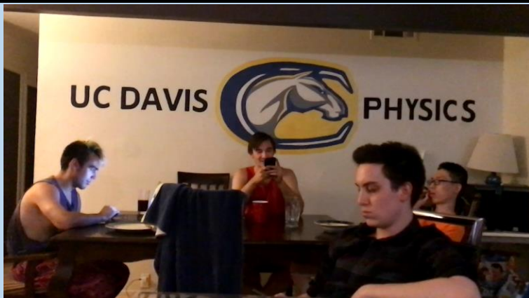
Hanging out at Physics House for a summer kickback.