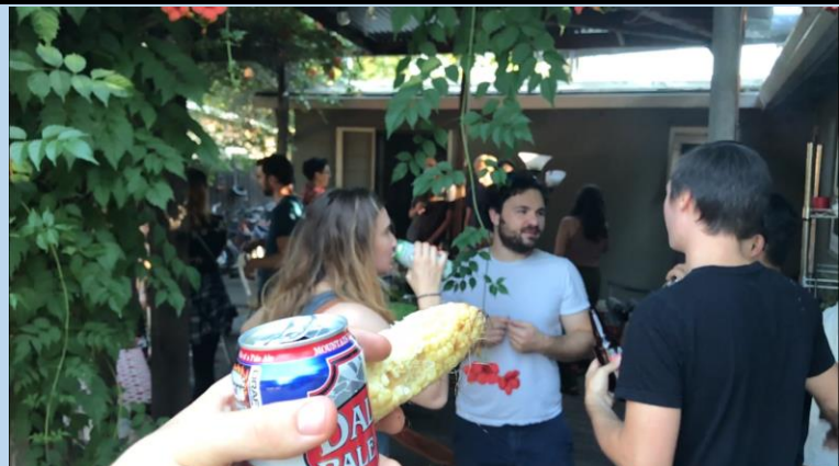
My first Californian Fourth of July. (Undeclared in cornhole.)

I'm coming back to NC tomorrow! Let's make plans!