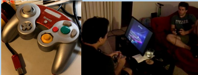
Left: My freshly-painted controller. Right: Home training.