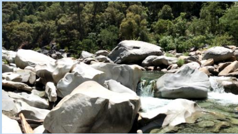
Post-first-year day trip to the Yuba River

Year one done! With finals complete, my next hurdle is the Prelim Exam, a comprehensive four-day test. Then I'm a "Master." I've been taking a few celebratory weeks to work on some side projects and hang out, but prelim practice starts soon.